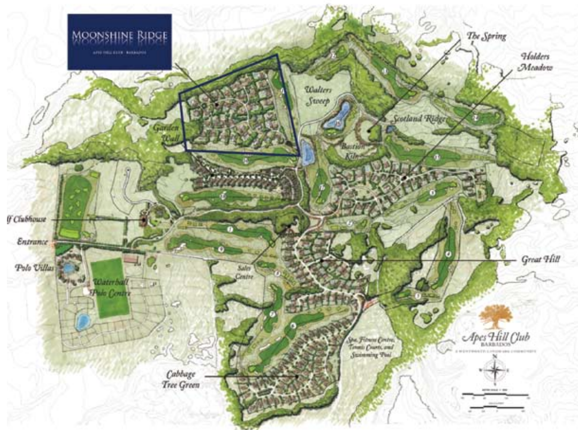
APES HILL CLUB MASTERPLAN