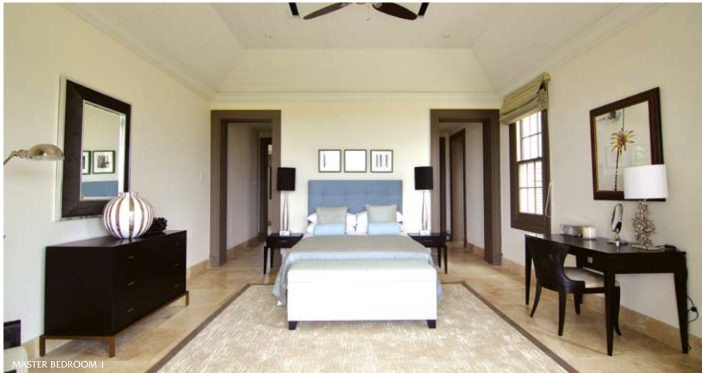
MASTER BEDROOM 1