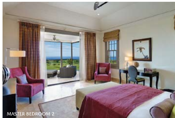
MASTER BEDROOM 2