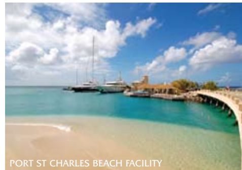
PORT ST CHARLES BEACH FACILITY

Moonshine Ridge occupies a prime location on the top of a forested ridge, gently sloping towards the Caribbean Sea and bordered by the 10th and 11th fairways of a championship-calibre golf course within Apes Hill Club, Barbados.